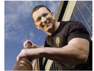
Food Network chef Robert Irvine joins an impressive line-up of nine top chefs.